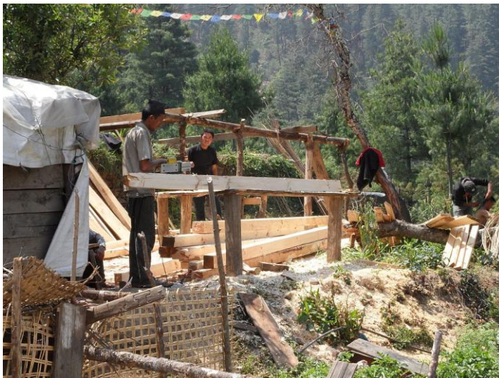
Villagers are helping each other