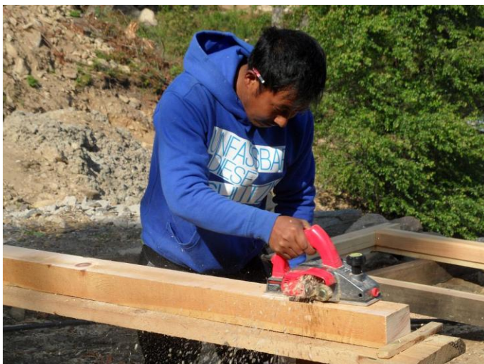
Wooden work – windows and door frames are constructed