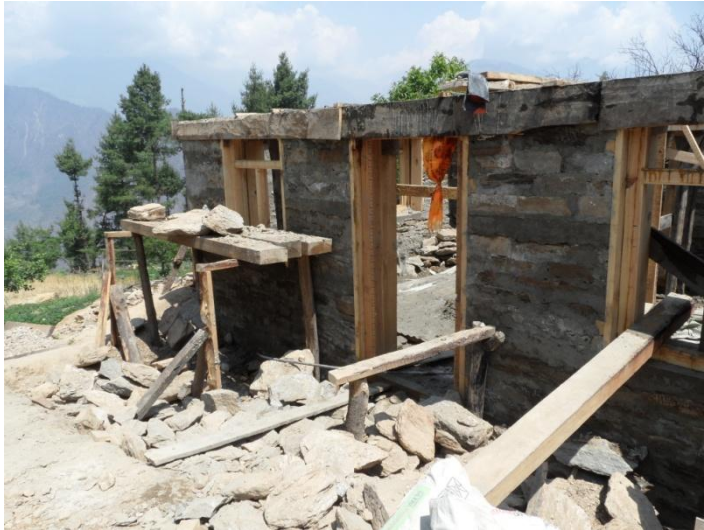
Second model house is being constructed