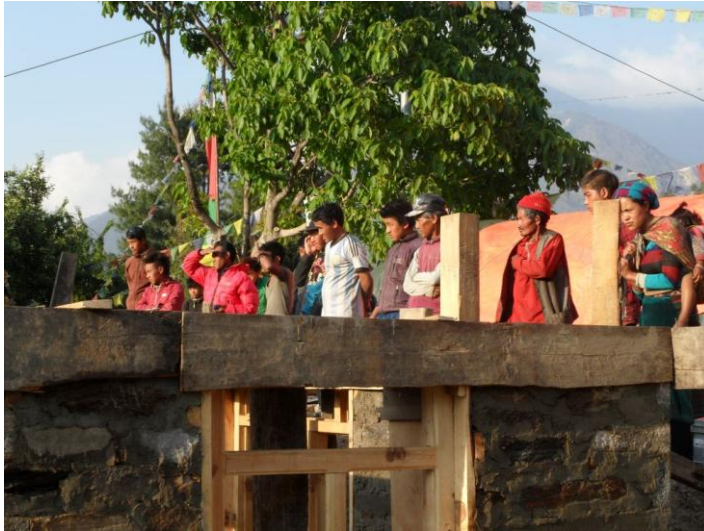
Workers & house owner in Brabal

Our project for reconstruction is progressing as well. Before leaving to Germany, it was an affair of heart for me visiting the reconstruction project in Brabal. Therefore we traveled from the 18th to the 20th of May very quickly to Brabal and back to Kathmandu.