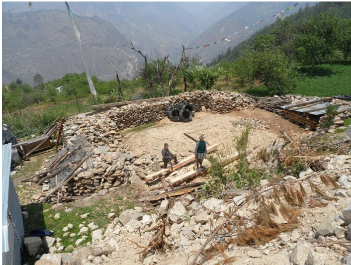
Another building site is being prepared

We are still having materials (cement, sand and steel) for five more houses in Brabal. It depends on the monsoon if we are able to continue the construction. Furthermore, Temba is concentrating on getting approval in Dhunche. Having completed two houses, we are able to exactly quantify the costs for one house. The costs include transport (Trisuli to Brabal), material (Sand, cement, steel, corrugated metal), working (workers form Okhaldunga region). For one house this is 7,250 Euro.