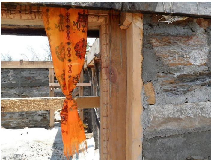
Door frame with wonderful carvings

Our project for reconstruction is progressing as well. Before leaving to Germany, it was an affair of heart for me visiting the reconstruction project in Brabal. Therefore we traveled from the 18th to the 20th of May very quickly to Brabal and back to Kathmandu.