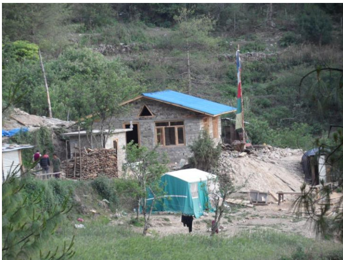
First model house in Brabal

I was overwhelmed when I arrived in Brabal: