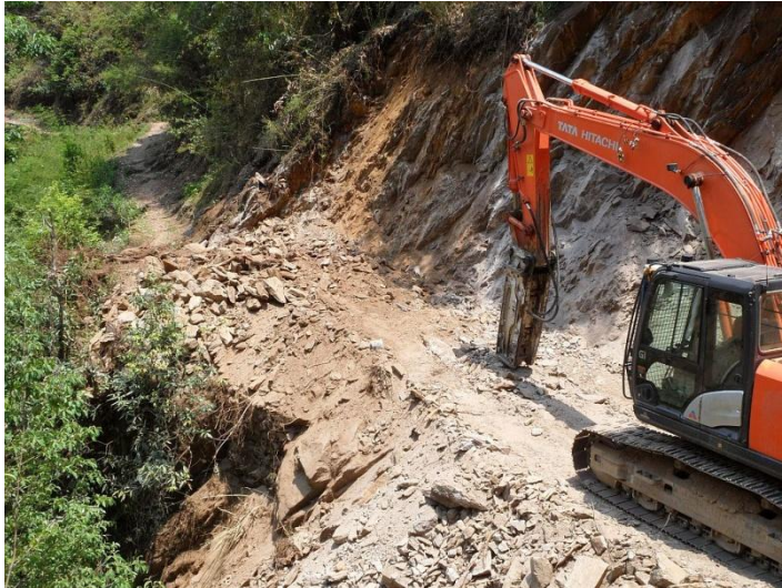
A traversable road is arising

I was overwhelmed when I arrived in Brabal: